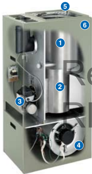
3-ton highboy shown. Other models may vary.