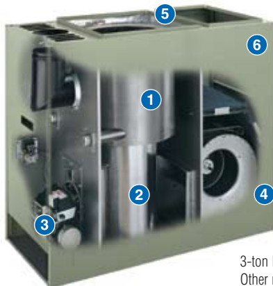
3-ton lowboy/front flue shown. Other models may vary.